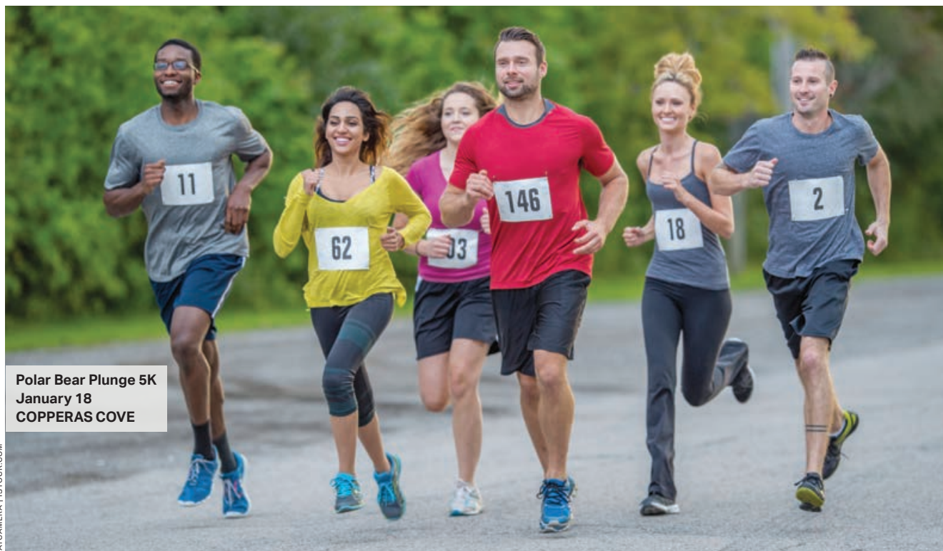
Polar Bear Plunge 5K January 18 COPPERAS COVE

For more information about Hico events, contact the Hico Chamber of Commerce at (254) 434-1249 or chamberhicotx@gmail.com .