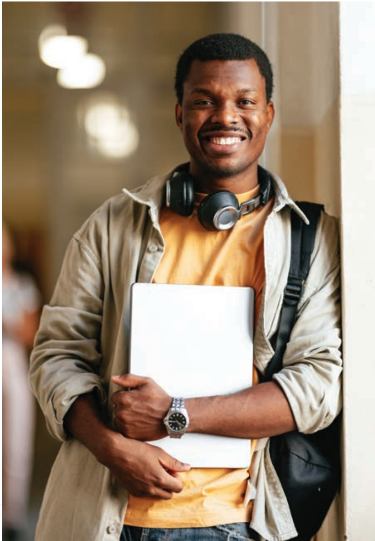
MINISERIES | ISTOCK.COM